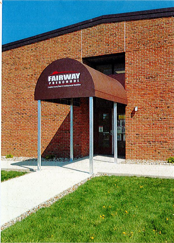
New canopy for Parent Pick-up Entrance

We also have some exciting news to share about other updates to Fairway Preschool that will be taking place this summer (watch future Horizons for pictures and details). Out-of-sight behind the school, where you will not be able to see, there will be great things for the children to find in the fall when they return to school. Our playground will be more colorful and inviting as it is being renovated with new ground covering and some new playground equipment that will be more inclusive. Like we said.....stay tuned for more information as we complete this project.