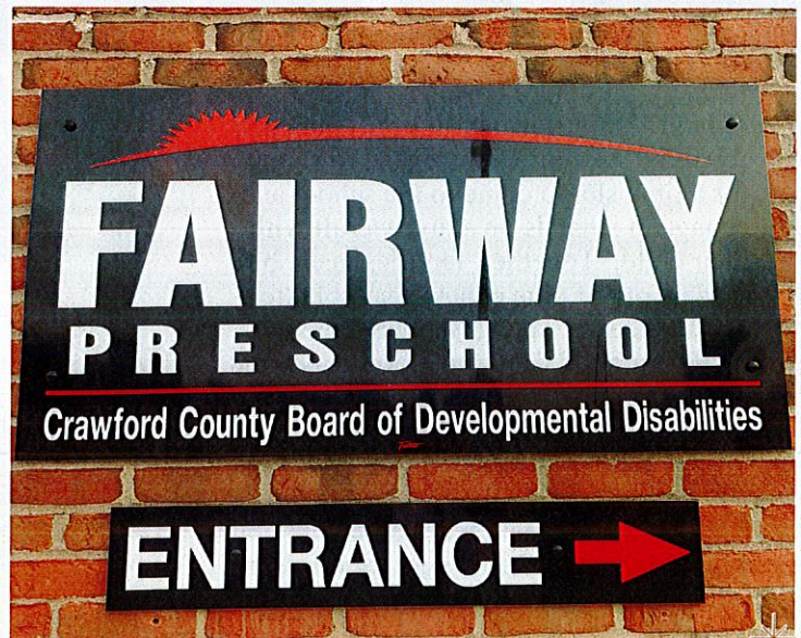
New Entrance sign for Fairway Main Entrance

We do ask that parents continue to use the front entrance to the school for dropping off and picking up students. We also want to inform any visitors to our building that they must use the main entrance, as the doors to the other entrance are locked.